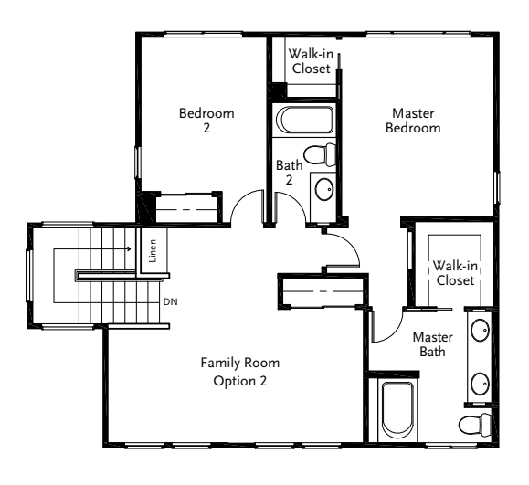
Second Floor Option 2 Family Room

3 Bedroom, 3 Bath with Option 2 Family Room