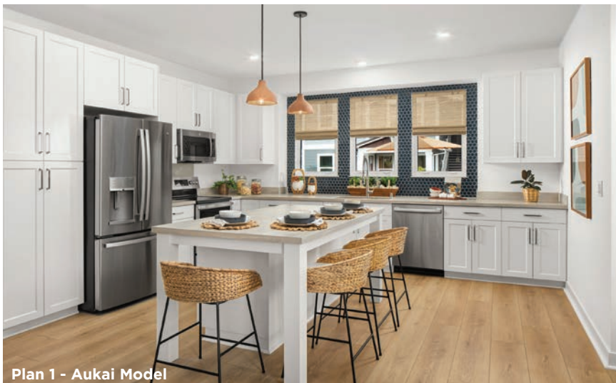
Plan 1 - Aukai Model